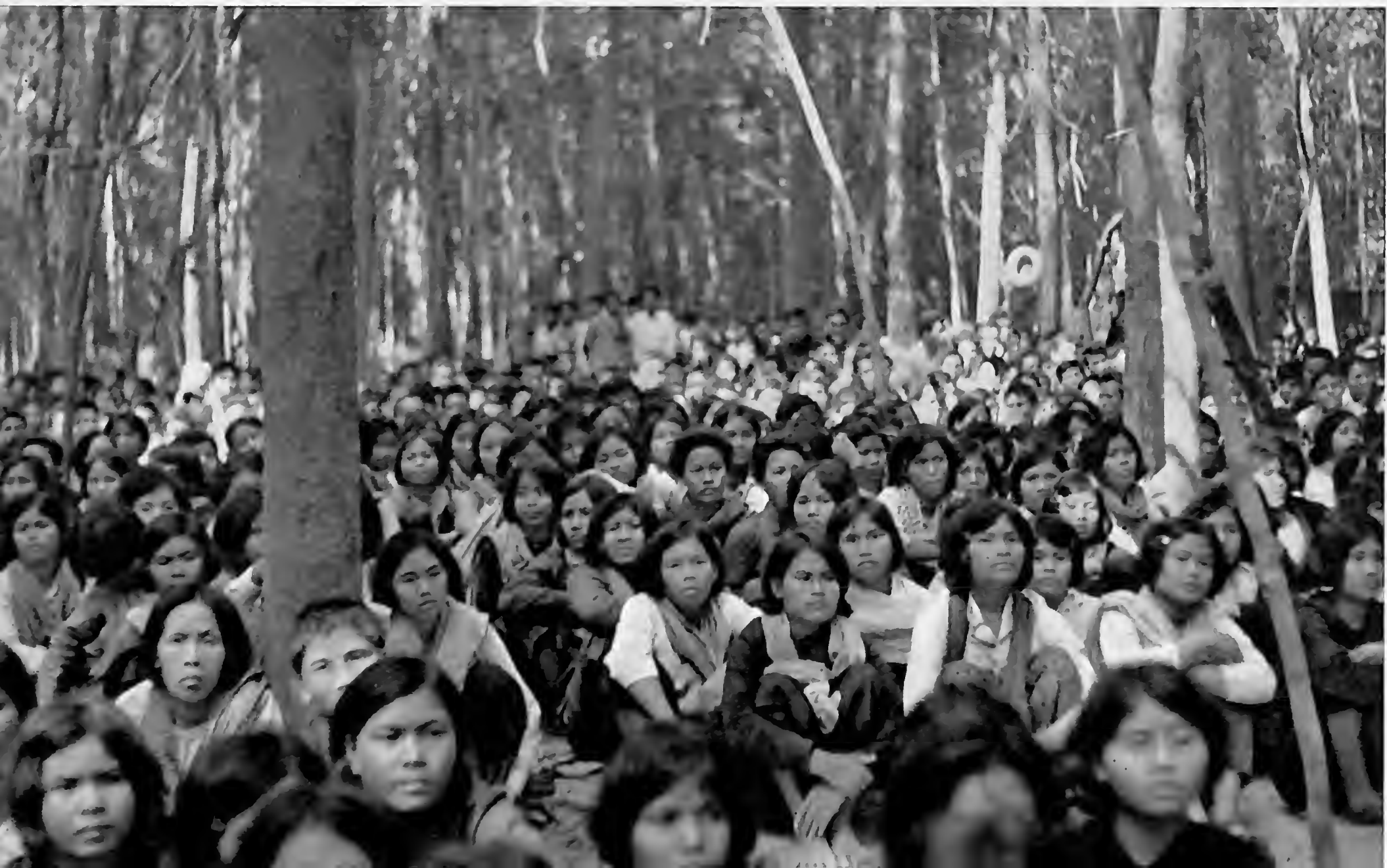
Listening attentively to the Head of State.